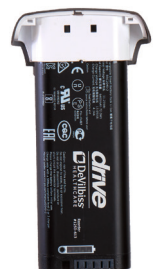
Rechargeable Battery 125D-613