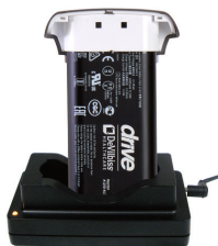
iGo2 Charging Station (Battery not included) 125CH-614