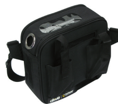
Carrying Case 125D-670